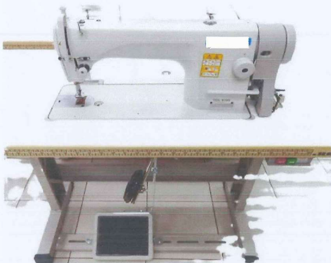
3 Threads Edging Sewing Machine-Heavy duty